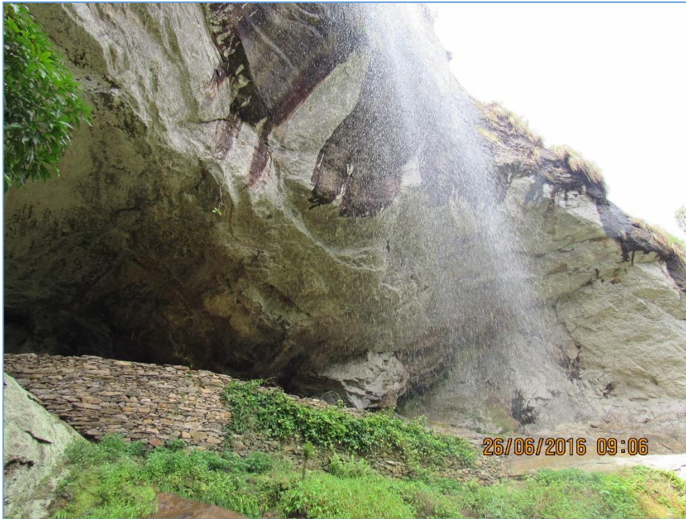
The cave, with cascading water flowing across its entrance, was a brilliant sight to behold.

Many varieties of butterflies were observed out of which the chocolate soldier (left) and the blue bottle (right) were outstanding.